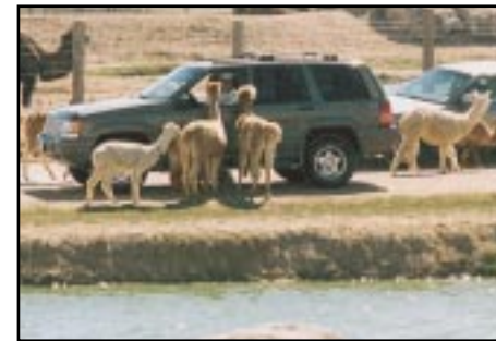
Get up close and personal with Nature's Friends.