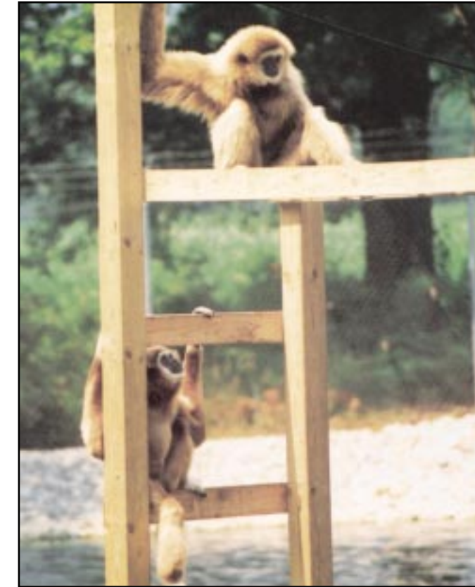
Monkeying around is always fun at African Safari Wildlife Park.