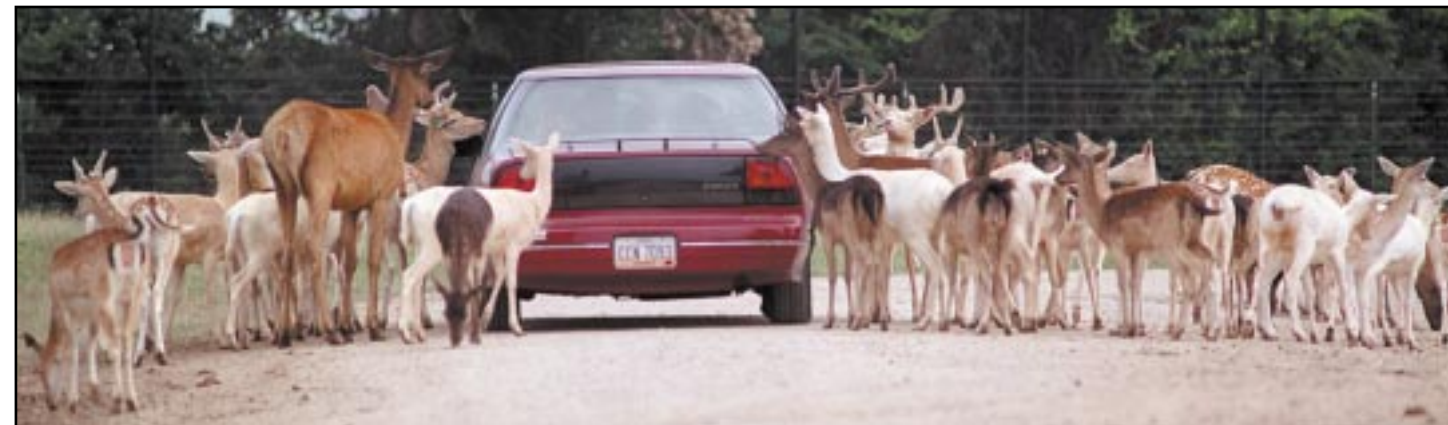
Like Noah leading the animals onto the Ark, automobiles driving through African Safari Wildlife Park in Port Clinton don't have much trouble drawing a four-legged crowd. An ostrich, a buffalo and a rare white zebra are as curious about visitors as visitors are about them.