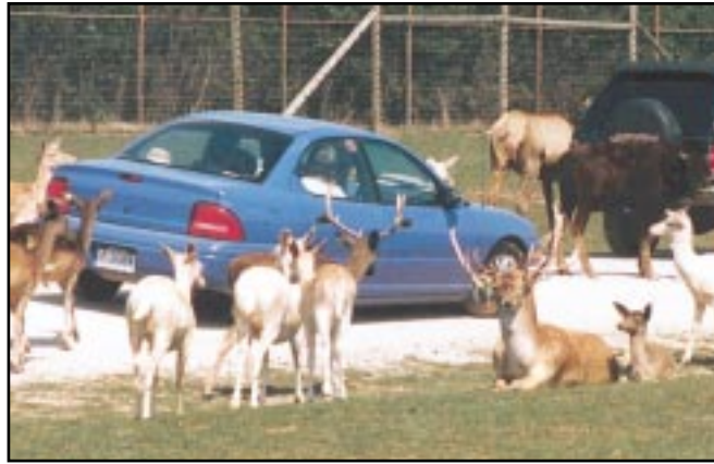
Little Miracles occur often at African Safari Wildlife Park and babies are often born throughout the Season. Capture the great photo opportunities.