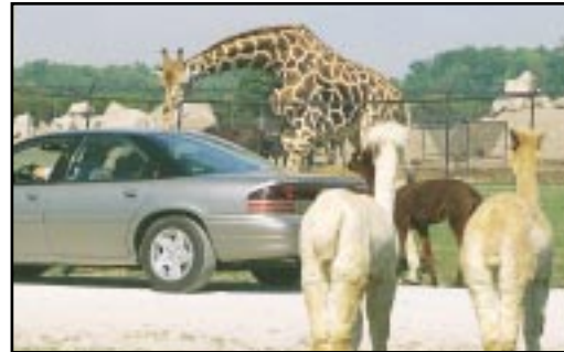
'Thrilling' is how most safari-goers describe their first encounter with a giraffe!