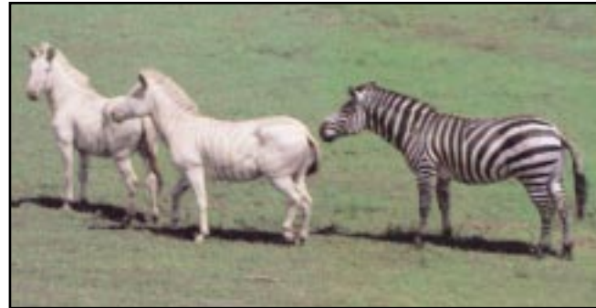
Come and see our "horse of a different color," the rare white zebra! These are two of only a few in the entire world and the only white zebra exhibited in the United States.