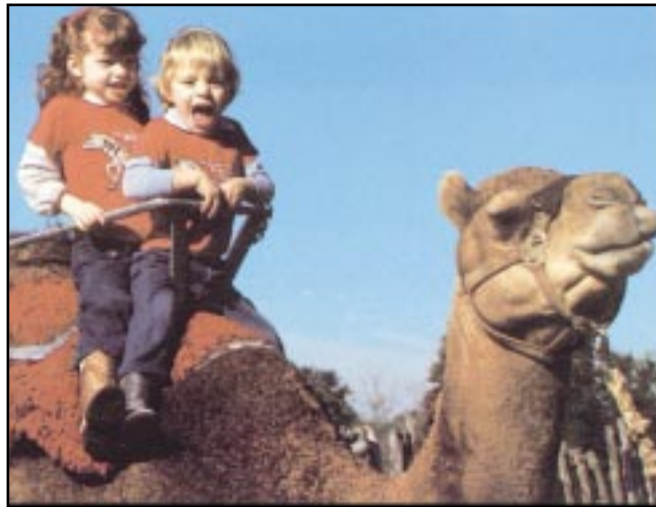
You can look at camels inside enclosures at other parks or you can experience a real camel ride at African Safari! The adventure awaits you and your family!